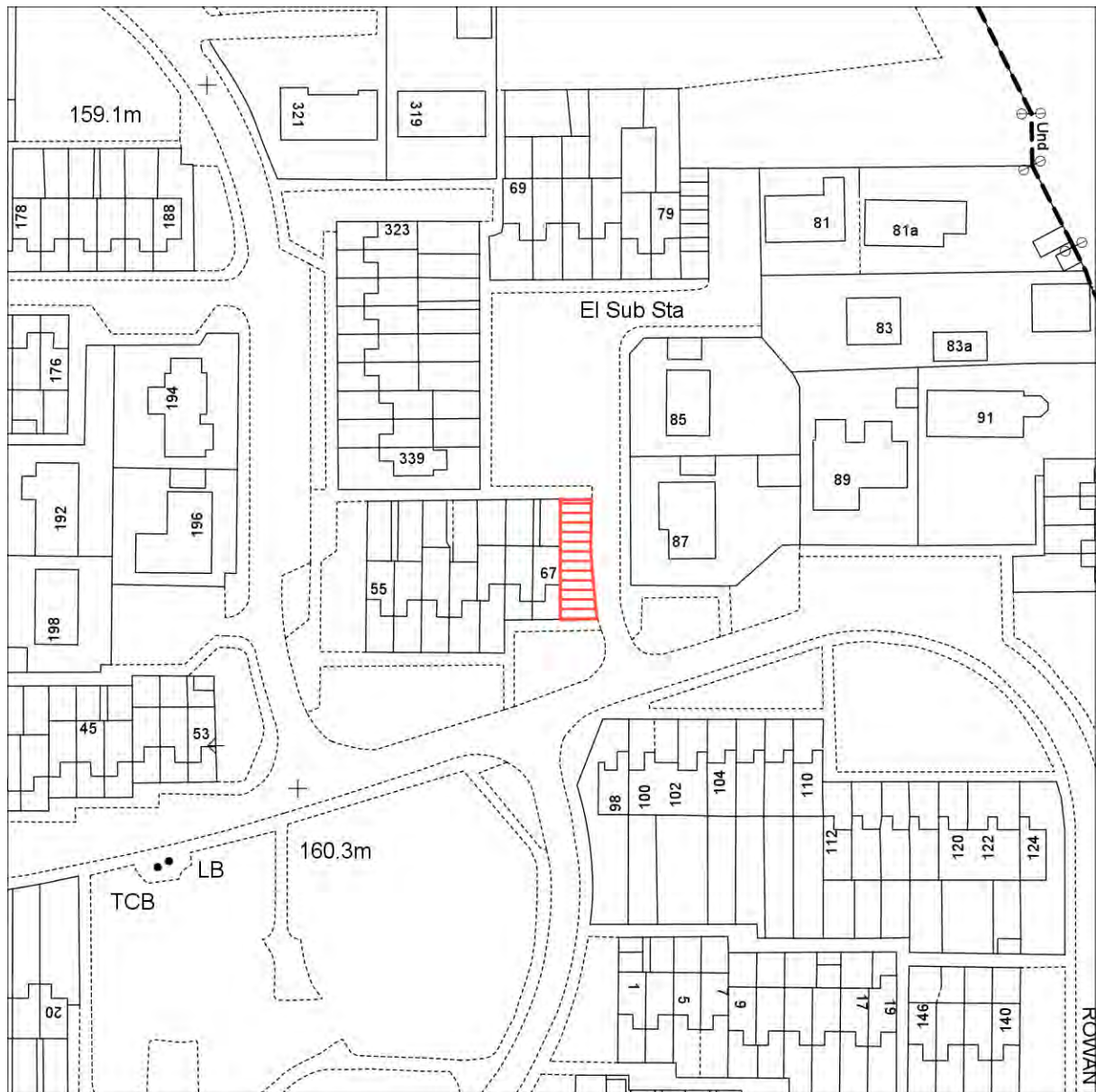
67, Rowan Drive, Blackburn, Bathgate